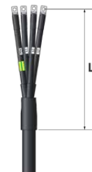
L t = Termination length