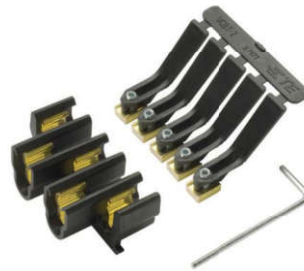
Universal connector block

Closing the rugged RayGel Plus enclosure is literally a snap. Its short length also allows installation in cramped locations. No special tools needed, no rip cords to break, and no trimming, mixing, pouring, or heating required; RayGel Plus joints can be put into service immediately.