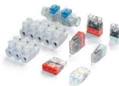
Terminal strips and push-wire connectors

PowerGel filled enclosure, universal connector block including sliding nut insertion tool and allen key (for RayGel Plus 2/3 joints), tie wraps for a strain relief of the cables and illustrated installation instructions. All joints are available in one piece packaging.