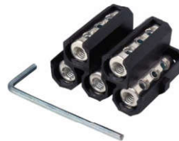
Connector block CB2/CB5

A supplementary tool helps to insert the sliding nuts and holds them in place until the connection is finalised.