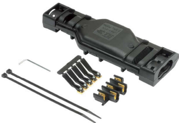
RayGel Plus 2/3 kit content

This very compact connector solution can be used for straight connections, where space in installation is limited.